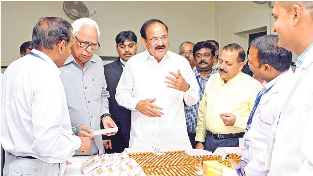
The Vice-President, M Venkaiah Naidu at the Value Addition Lab, at Indian Institute of Integrative Medicine, in Jammu & Kashmir. The Governor of Jammu and Kashmir, N N Vohra and the Union Minister of State for Development of North Eastern Region, Prime Minister's Office, Personnel, Public Grievances & Pensions, Atomic Energy and Space, Jitendra Singh, are also seen

In addition, this campus will be a hub for carrying out high-end research and innovation as well as support skill development in fields such as chemical engineering, petrochemicals, textiles, pharmaceuticals, and energy. The skill development insti-