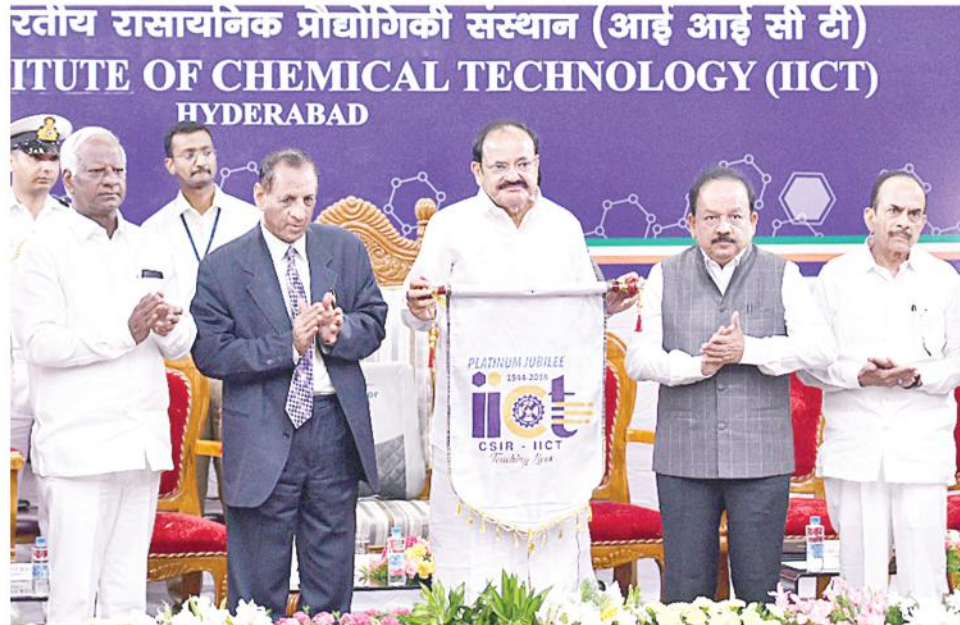
The Vice-President, M Venkaiah Naidu, unveiling the new logo of Council of Scientific and Industrial Research-Indian Institute of Chemical Technology (CSIR-IICT), at platinum jubilee celebrations of CSIR-IICT, in Hyderabad. The Governor of Telangana, E S L Narasimhan; Union Minister for Science & Technology, Earth Sciences and Environment, Forest & Climate Change, Harsh Vardhan are also seen