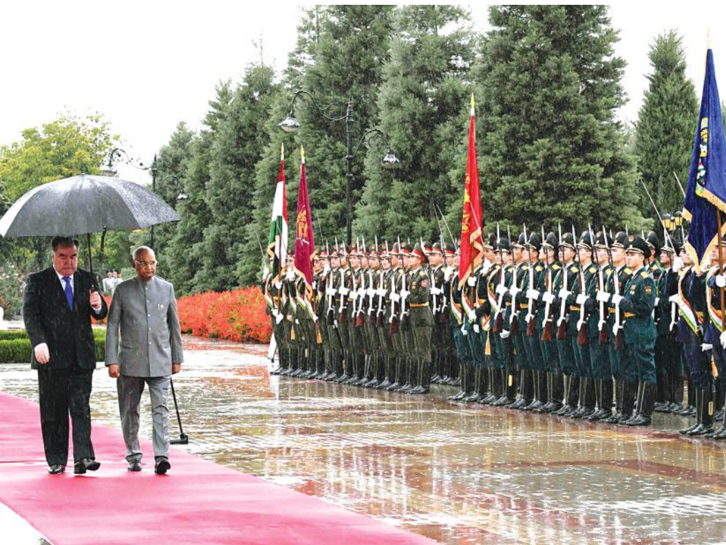
The President, Ram Nath Kovind, inspecting the Guard of Honour at the ceremonial welcome, at Palace of Nation, in Dushanbe, Tajikistan. The President of Tajikistan, Emomali Rahmon, is also seen

About $75 million has been committed so far to the fund, with Norway providing the initial pledge of $15 million as part of a planned multi-year contribution to Problue. Canada announced it would contribute $50 million to the fund and other donors include Germany, Sweden, Iceland and the European Commission. Denmark and France are also expected to contribute to Problue.