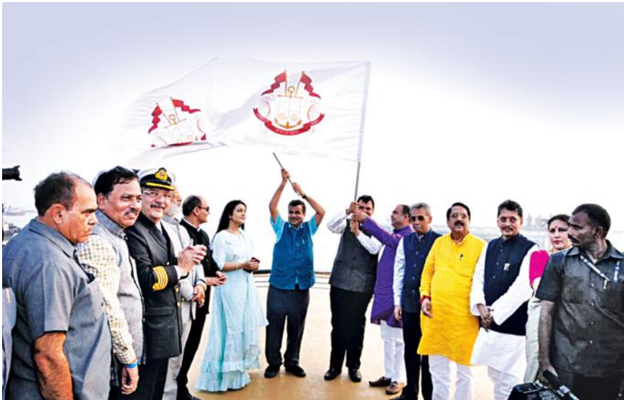
From Page 1

S PEAKING of various transports modes such as water, coastal roads, monorail and metro rail, the Chief Minister of Maharashtra, Devendra Fadnavis said the ticketing systems of these various modes will soon be integrated. The Mumbai-Goa cruise service is India's first luxury cruise liner. It would sail to Goa three days a week. It would give a new dimension to cruise services and help expand its horizons in Maharashtra, Gujarat, Karnataka and Kerala. The new terminal is centrally air-conditioned, with facade lighting. Mid-size cruise vessels with a carrying capacity of 300-400 passengers would be operated from Mumbai to Goa from the new terminal. Interacting with the media on board the maiden voyage of Angriya, the Union Minister for