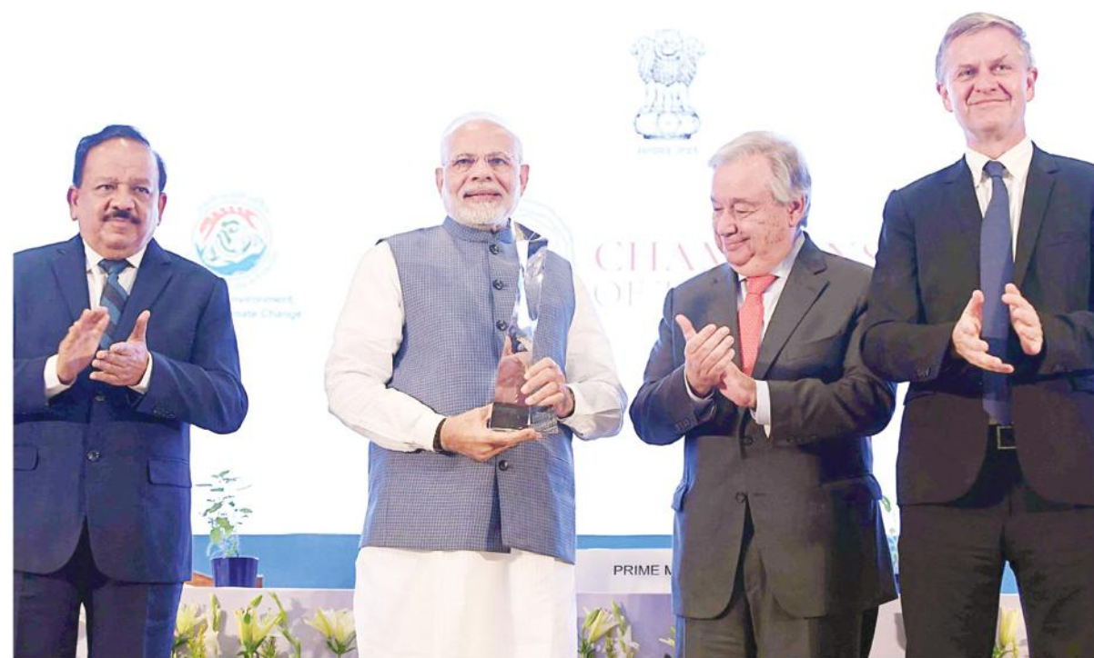
The Prime Minister, Narendra Modi, being presented the 'Champions of The Earth' award by Secretary General of the United Nations, Antonio Guterres, in New Delhi